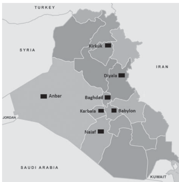
Fig. 1. Map of Iraq showing loci of the sampling sites in this study

Wheat plants that showed crown rot disease symptoms were collected from fields within seven provinces of Iraq (Fig. 1; Table 1). All samples were collected in paper bags and given a sample number. For each sample metadata were gathered, including the locality, date of collection, and cultivar type. Samples were then brought to the laboratory and air dried. Parts of wheat plants that exhibited crown rot disease were surface sterilized with 10% sodium hypochlorite (bleach) for 2 min, followed by a sterile water wash. They were then dried on filter paper and cut into 0.5–1.0 cm segments. Each sample segment was placed in a 9 cm Petri dish containing Potato Dextrose Agar (PDA) prepared by dissolving 39 g of PDA powder in 1 l of deionized water and sterilized in an autoclave for 20 min at 121°C under 1.5 kg · cm -1 pressure. To suppress bacterial growth, 50 mg of the antibiotic Agromycin was then