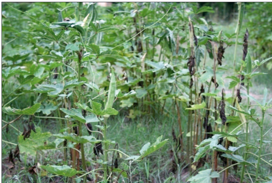
Fig. 1. Okra field infected with Fusarium and Phytophthora

tacks a wide variety of vegetables, fruits, grains and floral crops. It may remain viable for 10 years or more in soil (Baysal-Gurel et al. 2012). It is difficult to estimate yield losses due to Phytophthora diseases since the same species may cause a number of other diseases, in different environmental conditions, particularly rainfall and humidity, can have a dramatic effect on disease incidence and severity (Benson et al. 2006). Most Phytophthora -related losses can be attributed to Phytophthora pod rot (PPR) followed by stem cankers. It is commonly estimated that 10–20% of the world's annual production is lost due to PPR, but estimates vary from average annual losses of 10% up to 30%, with much higher losses in particularly wet locations or during wet years (Erwin and Ribeiro 2006). In Western Samoa, losses of 60–80% due to PPR in wet years were reported by Keane (1992).