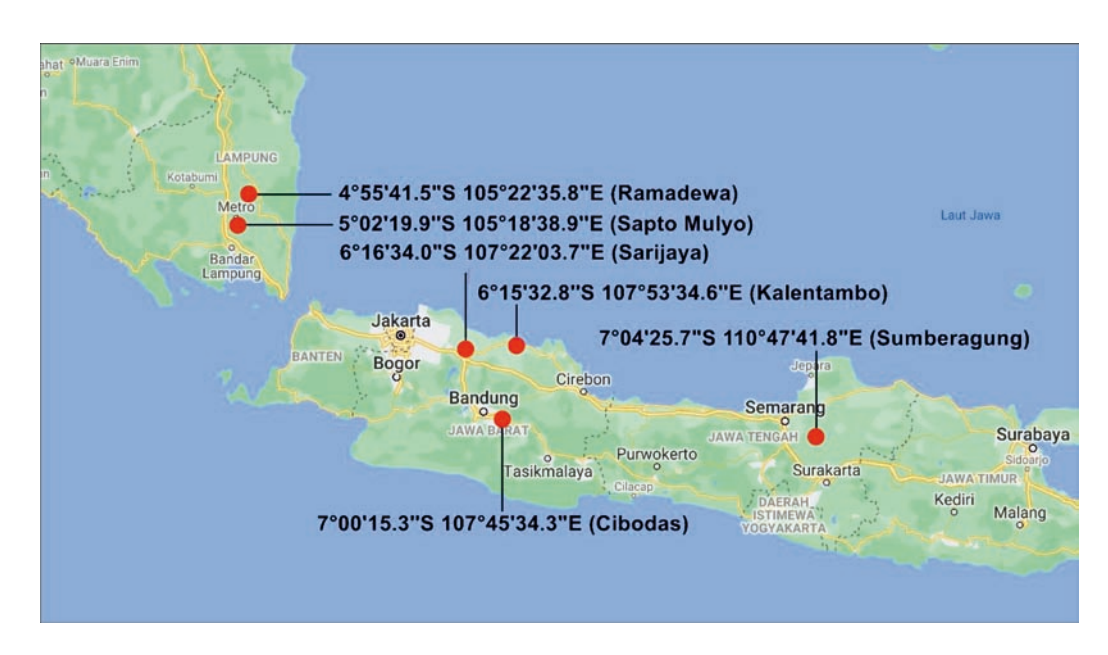
Fig. 1. Map of sample locations of Monochoria vaginalis

The material used was M. vaginalis weed from lowland rice plantations with high frequency of herbicide use (Fig. 1). The weed M. vaginalis originated from Sapto Mulyo village, Kota Gajah District, Central Lampung Regency, Lampung Province (5°02'19.9"S, 105°18'38.9"E), Ramadewa village, Seputi Raman District, Central Lampung Regency, Lampung Province (4°55'41.5"S, 105°22'35.8"E), Sarijaya village Majalaya District, Karawang Regency, West Java province (6°16'34.0"S, 107°22'03.7"E), and Kalentambo village, District of Pusakegara, Subang Regency, West Java Province (6°15'32.8"S, 107°53'34.6"E). The susceptible