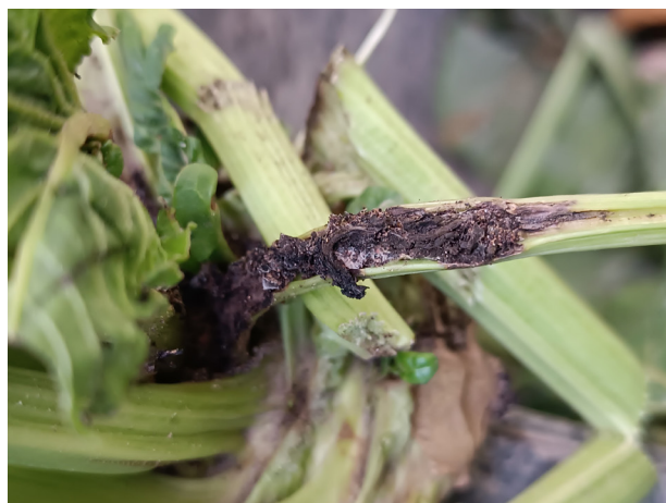
Fig. 5. Feeding tunnel at the base of the leaf

(Fig. 5). Several larvae can feed inside one tunnel (Al-Keridis 2016). The tunnel exit is contaminated with dark excrement and in some cases tunnels can be seen through the epidermis of the petiole. The damage heals over time, but is still visible during leaf growth (Górski et al. 2023). Leaves with heavily damaged petioles break off and necrotize (Renou et al. 1980). The outer leaves wither, turn yellow, and die back completely, forming a crown of dead foliage. In addition, the caterpillars roll up the edges of the leaves with a silk web and feed inside these shelters (Sekulić and Kereši 2003; Valič et al. 2005; Bažok 2015). The growth of the heart leaves is inhibited and the plants produce many young leaves