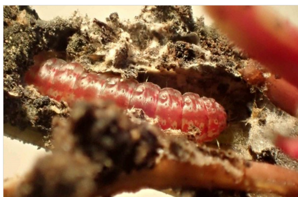
Fig. 2. Larva of Scrobipalpa ocellatella

narrower in the male (Al-Keridis 2016). A freshly deposited egg is 0.5 mm long, oval, yellowish and darkens to yellow-green shortly before hatching (Bažok et al. 2015; Al-Keridis 2016; Abdel R-ahman 2018). The caterpillar has a brown head, three pairs of thoracic legs and five pairs of abdominal prolegs on segments 3, 4, 5, 6 and 10. Caterpillars molt five times (Bažok et al. 2015), reaching a length of up to 12 mm (Maceljski 2002), and the last instar is gray with five dotted pinkish stripes running along the body (Fig. 2). Larva can be distinguished from related species, e.g., the goosefoot moth Scrobipalpa atriplicella , based on the arrangement of setae on the frontal part of the head and the prothorax (Chod et al. 1984).