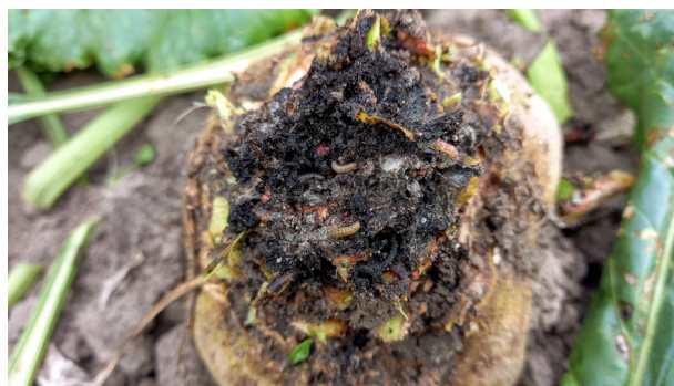
Fig. 6. Highly damaged and contaminated root head

from the lateral buds, which reduces the sugar content in roots. Heavily infested sugar beets lose up to 24% of their sugar content (Ghada and Heba 2022). Beet crown damage (Fig. 6) becomes a site for the invasion of fungal pathogens causing root rot (Fig. 7) (Valič et al. 2005), which leads to the greatest losses in sugar yield. The root crown turns black, and infections often penetrate deeper into the root. Roots do not store well in piles and often rot (Vičar 2004). Rhizopus root rot causes further losses during longer storage. Affected sugar beets are usually unsuitable for long-term storage and processing (NASBG 2023). In addition, damage to sugar beet roots activates invertase, which contributes to post-harvest sucrose losses (Rosenkranz et al. 2001). Processing parameters of sugar beets deteriorate, including an increase in the content of molasses-forming substances.