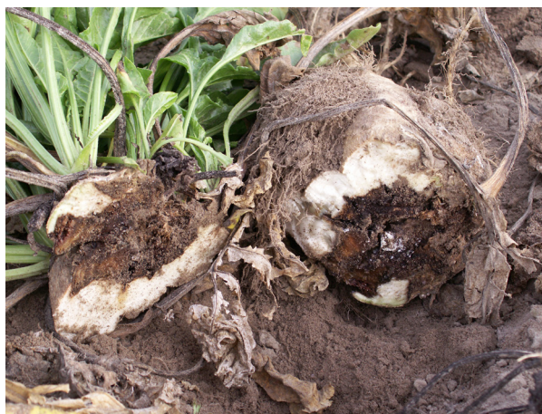
Fig. 10. Dry rot caused by boron deficiency may be mistaken for damages caused by Scrobipalpa ocellatella