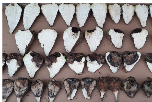
Fig. 7. Root rot caused by larvae feeding

Very early in 2018–2019 severe beet infestation in some regions of Germany was followed by serious fungal infections causing root rot in damaged plants, which resulted in up to 50% reduction of sugar yield in many sugar beet plantations (NASBG 2023). Abo-Saied Ahmed (1987) found that severe infestation of