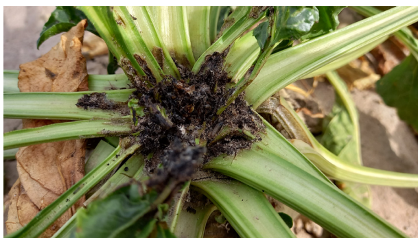
Fig. 4. Larva Scrobipalpa ocellatella feeding on heart-shaped sugar beet leaves

of larvae is recorded during the harvest period, in August and September (Vrabl 1992). Feeding larvae cause a decrease in root yield and deteriorate root quality (Shalaby 2001; Bazazo 2010; El-Dessouki et al. 2014; Ahmadi et al. 2018). Newly hatched larvae mine leaves (Chod et al. 1984), then hide between the heart leaves and inside petioles (Fig. 4), in which they bore tunnels