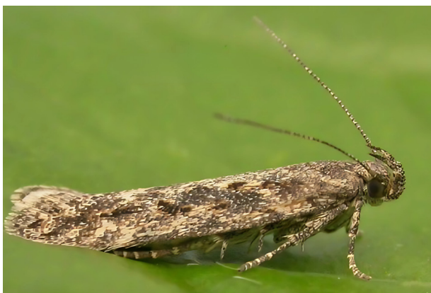
Fig. 1. Moth of Scrobipalpa ocellatella

The body of adults is 6–8 mm long and the wingspan is 12–15 mm (Fig. 1) (Bažok et al. 2015). The wings are very narrow, elongated, with a light fringe