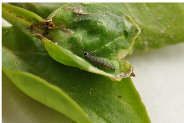
Fig. 8. Leafroller in sugar beet, may be mistaken for larva Scrobipalpa ocellatella

sugar beet with S. ocellatella caused a 38.20% decrease in root mass and a 52.40% decrease in sugar content. Sekulić and Keresi (2003) reported a 19% lower root yield and 48% lower sugar yield. According to Razini et al. (2016), a plant damage index of 20–25% under field conditions was associated with 2.3 to 3.8 t/ha lower root yield and 0.5 to 1.15% lower polarization. The annual mean losses caused by S. ocellatella in sugar beet plantations in Iran are higher than 10% (Anonymous 2020). Regardless of the percentage of above-ground parts damaged, S. ocellatella disrupts plant growth and has a negative effect on the normal development of beets. Damage caused by S. ocellatella may be mistaken for symptoms of feeding leafrollers (Tortricidae) (Fig. 8), herbicide-induced damage, symptoms of drought, two-spotted spider mite feeding and, later in the season, with heart leaf scorch of sugar beet (Fig. 9) and dry rot (Fig. 10) caused by boron deficiency (Piszczyk et al. 2020b).