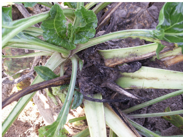
Fig. 9. Heart leaf scorch caused by boron deficiency, may be mistaken for damages caused by Scrobipalpa ocellatella