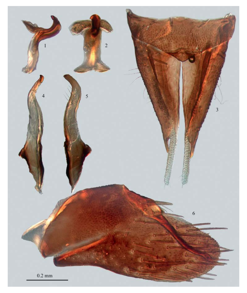
Fig. 3. Apex of male abdomen of Orientus ishidae : aedeagus, lateral view – 1; aedeagus, posterior view – 2; abdominal sternite, genital plates and valves, ventral view – 3; right genital style, lateral view – 4; right genital style, dorsal view – 5; pygofer with process, side view – 6.

10 VII 2014: 1♂, sticky trap for catching grey larch tortrix ( Zeiraphera griseana (Hüb.)) hung in a 100-year old spruce stand, Bruder D. leg., Klejdysz T. det. et coll.;