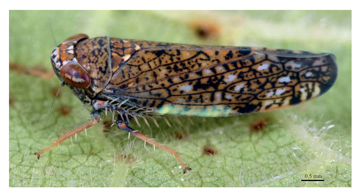
Fig. 1. Mosaic leafhopper - Orientus ishidae on a hazel leaf (Corylus avellana) in Poznań, Poland

the following European countries: Czech Republic in 2004 (Malenovsky and Lauterer 2010), Austria in 2007 (Nickel 2010), France in 2009 (Callot and Brua 2013), Hungary in 2010 (Koczor et al. 2013), Great Britain in 2011 (Anonymous 2012), Slovenia (Jurc 2010), Switzerland (Günthart and Mühlethaler 2002) and Germany in 2002 (Nickel 2010). There is some information posted on internet forums on the occurrence of O. ishidae in Belgium, Slovakia and Spain (Anonymous 2015).