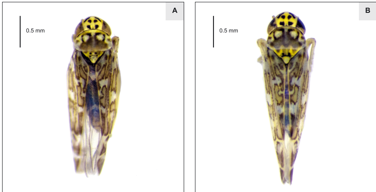
Fig. 1. Male (A) and female (B) of Eupteryx decemnotata