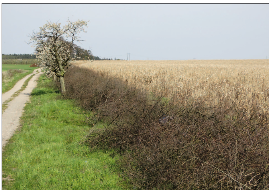
Fig. 4. Destruction of bird-rich roadside shrubs near miscanthus plantation in northern Poland. While bioenergy fields are valuable habitats to some birds, it might be not enough to balance the loss of such structures

Such small-scale structures are rarely included in spatial models that often concentrate on relationships between birds, field crops, grassland and set-aside or fallow land, ignoring smaller structures. However, such structures provide indispensable habitats for farmland birds [e.g. Goławski and Kasprzykowski (2011) for manure heaps], and their importance is quantifiable (Morelli 2014). Their abundance in Central and Eastern Europe might buffer the negative effects of energy crops expansion, provided that they are not destroyed by agricultural intensification (Fig. 5). When modelling bird abundance in eastern parts of the European continent, we strongly encourage