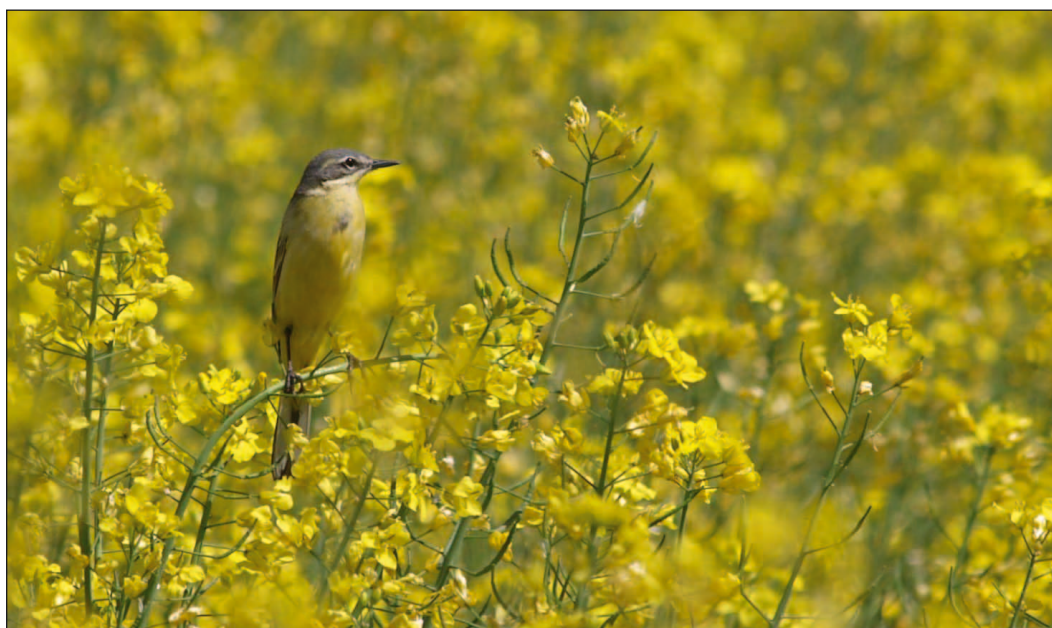
Fig. 1. Yellow wagtail ( Motacilla flava ). This decreasing farmland specialist uses some first generation bioenergy plantation as breeding habitat, but is still declining throughout Europe

fects birds mainly by crops entering previously uncropped or extensively cropped land (set-aside, meadows, abandoned farmland). In Western Europe, most of these types of habitats have already been destroyed by agricultural intensification. In contrast, in Central and Eastern Europe such habitats still thrive on relatively large areas (e.g. abandoned cropland in the Baltic countries and Ukraine, subsistence farming areas in eastern Poland or central Romania). As a consequence, there are greater possibilities for expansion of 2G energy crops in Central and Eastern Europe than in Western Europe [e.g. Kukk et al. (2010) on potential area of 2G energy crops in Estonia]. Such processes could change the farming landscape of Eastern Europe in the same way 1G energy crops did, and put farmland birds in this part of the European continent at significant risk.