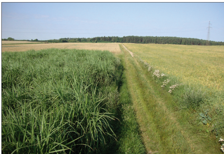
Fig. 3. Miscanthus field in northern Poland. The tall crop might increase heterogeneity of simplified farming landscapes, but its expansion can be detrimental to traditional, high nature value farmland of CE Europe