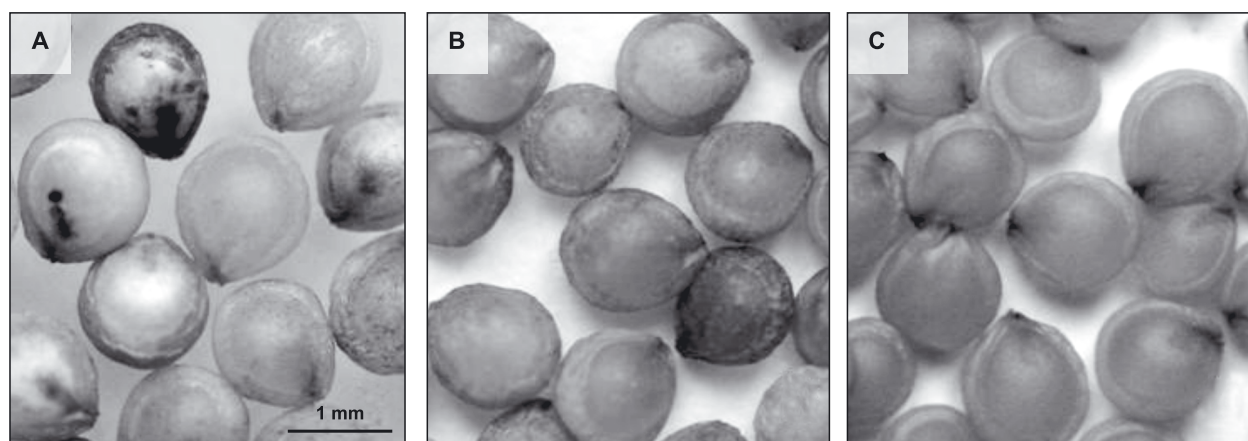
Fig. 1. Artificially (A) and naturally (B) discoloured amaranth seeds affected by Alternaria alternata ; normal in appearance seeds (C)

Artificially and naturally discoloured seeds displayed a higher concentration of fungal secondary metabolites in relation to normal appearance seeds (Table 2). Tenuazonic acid (TeA) was the main mycotoxin detected at high concentrations on discoloured seeds. The other important fungal secondary metabolites detected in order were: AME and AOH.