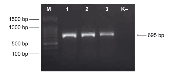
Fig. 2. Electrophoretic mobility of immuno-capture-reverse transcription-polymerase chain reaction (IC-RT-PCR) products with SBWMVCPF/SBWMVCPR on 1% agarose gel: M – marker DNA Nova 100 bp DNA ladder (Novazym); 1–3 – studied samples; K – negative control